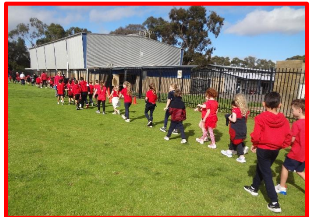
"Excellence and Care"